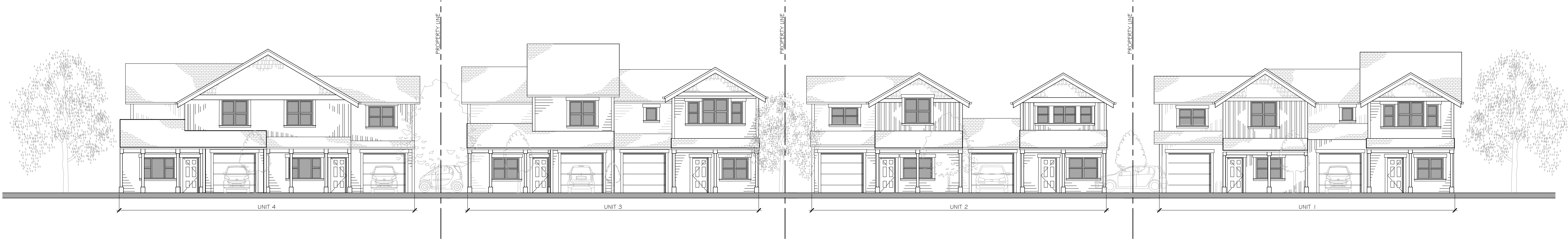
1 | elevations - sample streetscape - looking north